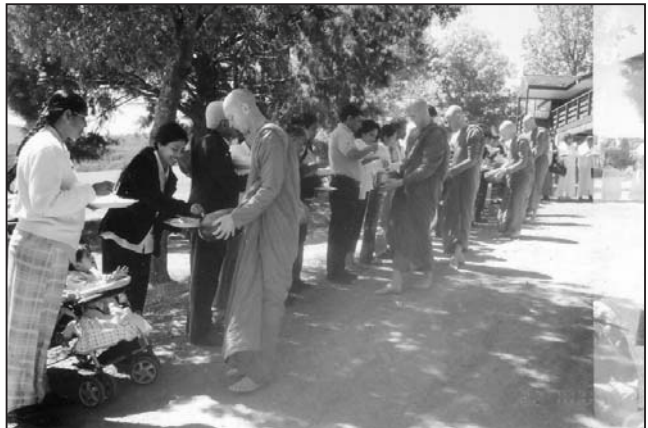
සිංහල සංස්කෘතික හා පුජා සේවා පදනමේ සාමාජික සාමාජිකාවන් වෝලිබෝල් ආරාමවාසී නිකුත් වනන්සේලාට ආනයන පිලිගැන්වූ අයුරු.