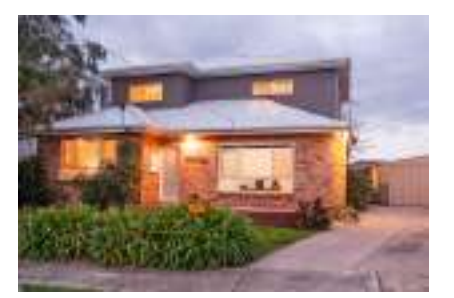
54/35 David Street 15 Godfrey Crescent Dandenong SOLD $720,000

Knowledge is power in the Real Estate industry, let us empower you with all the information to make the right decision. Achieving record prices all year round, call today for an obligation FREE Market Appraisal. Lets have a friendly chat!