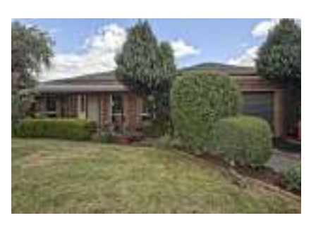
19 Eva Court Hallam SOLD $645,000