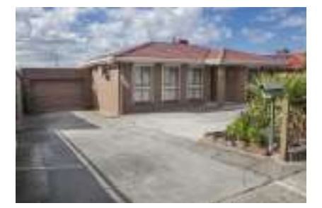
283 Gladstone Road Dandenong North SOLD $583,000