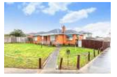
30 Titcher Road Noble Park North SOLD $586,000