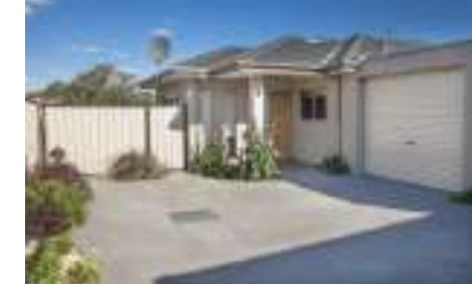
124A Doveton Avenue Doveton SOLD $430,000