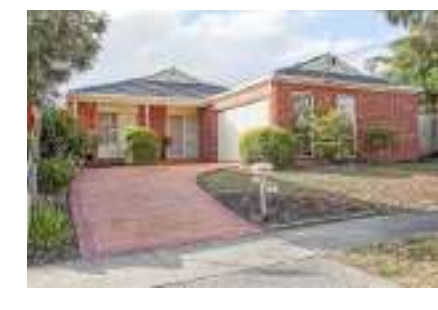
3 Warana Drive Hampton Park SOLD $590,000