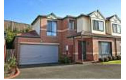
Dandenong SOLD $450,000