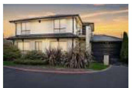
2/60 James Street, Dandenong SOLD $740,000