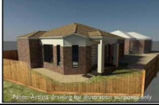
Note: Artists drawing for illustration purposes only