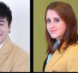
Max 0433 193