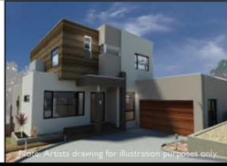
Note: Artists drawing for illustration purposes only