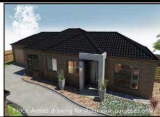
Note: Artists drawing for illustration purposes only