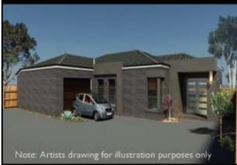
Note: Artists drawing for illustration purposes only