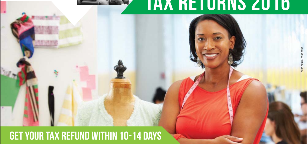
OLIVE DESIGN 9789 0089