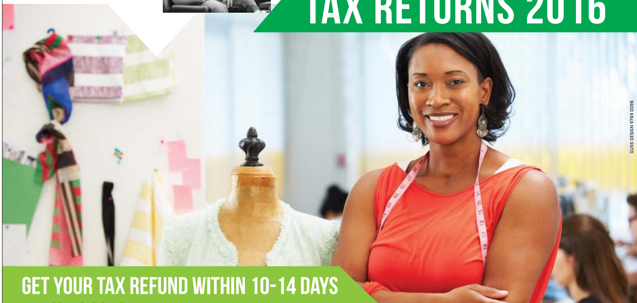
OLIVE DESIGN 9789 0089