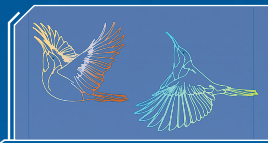
FLYING EASTERN SPINEBILL