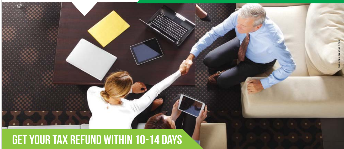
COUSS DESIGN 9788 0088